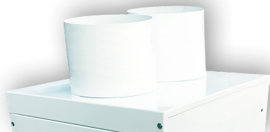
2 Supply Collars